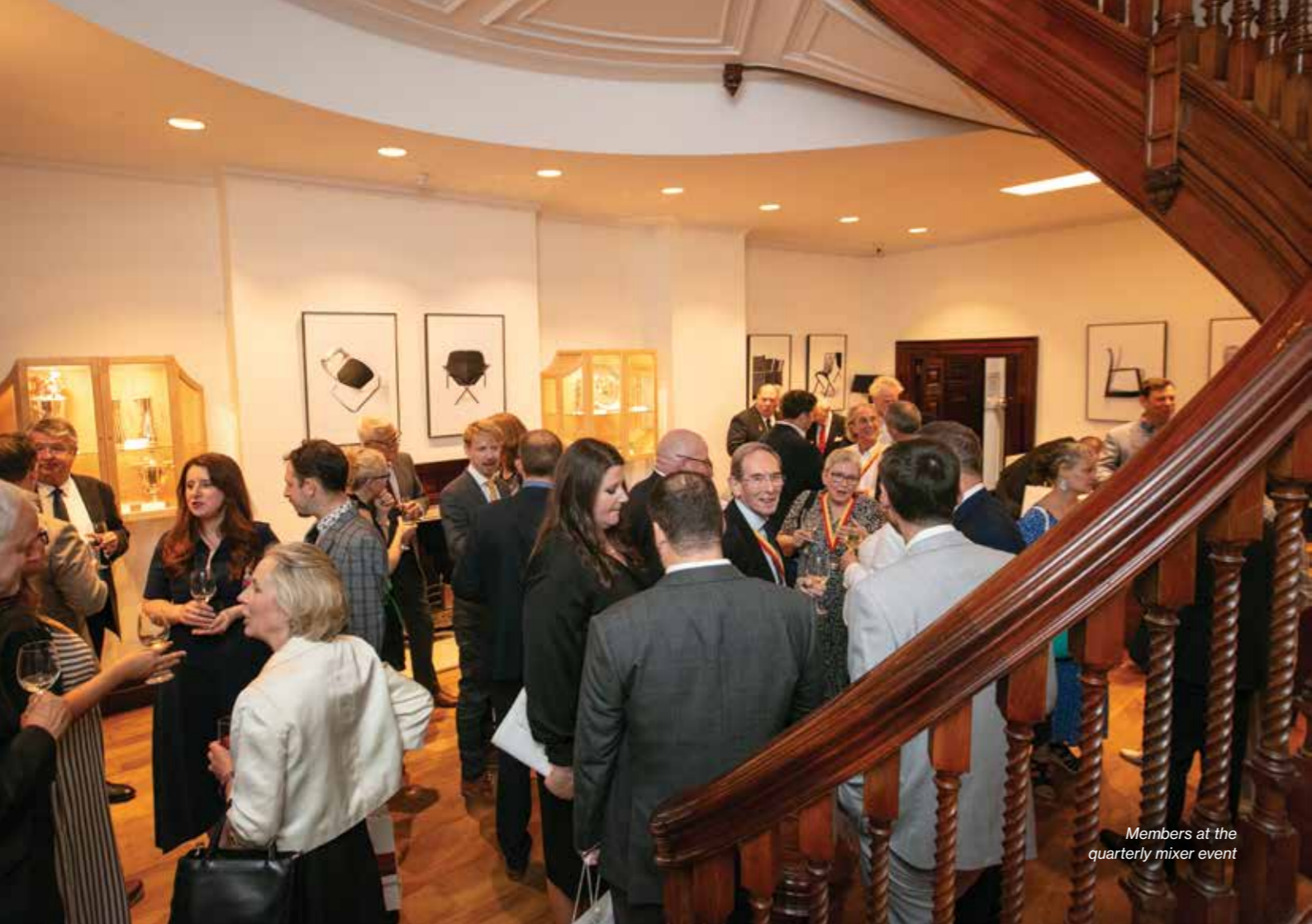
Members at the quarterly mixer event