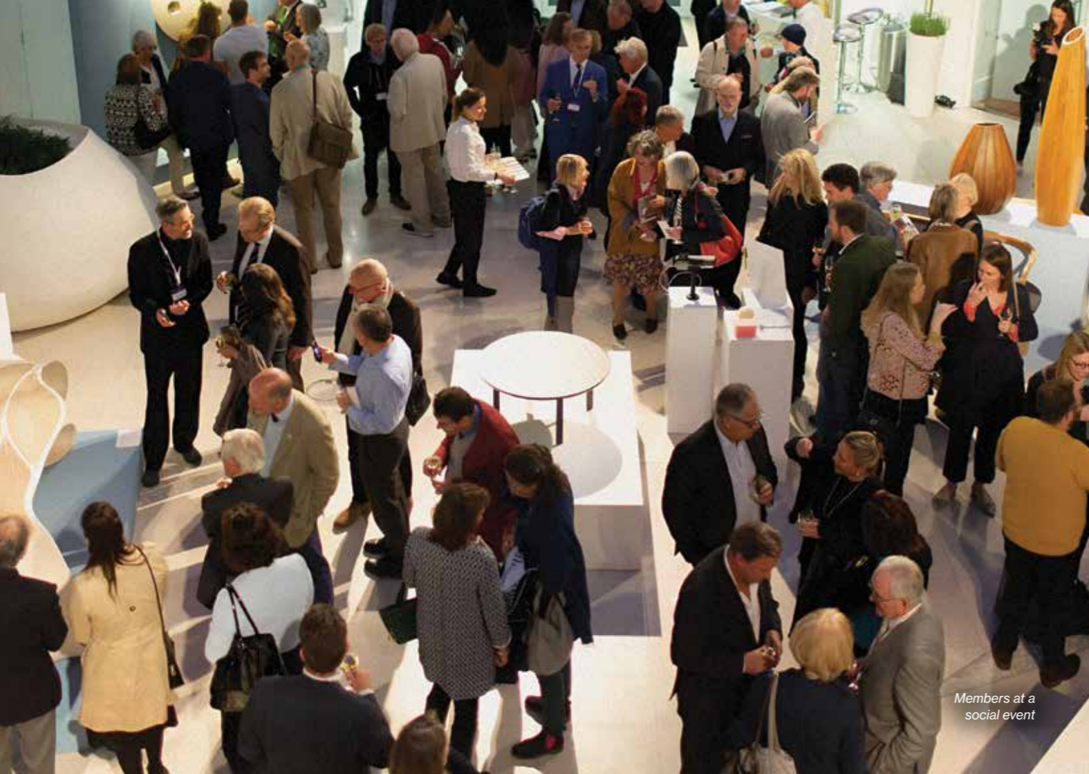
Members at a social event