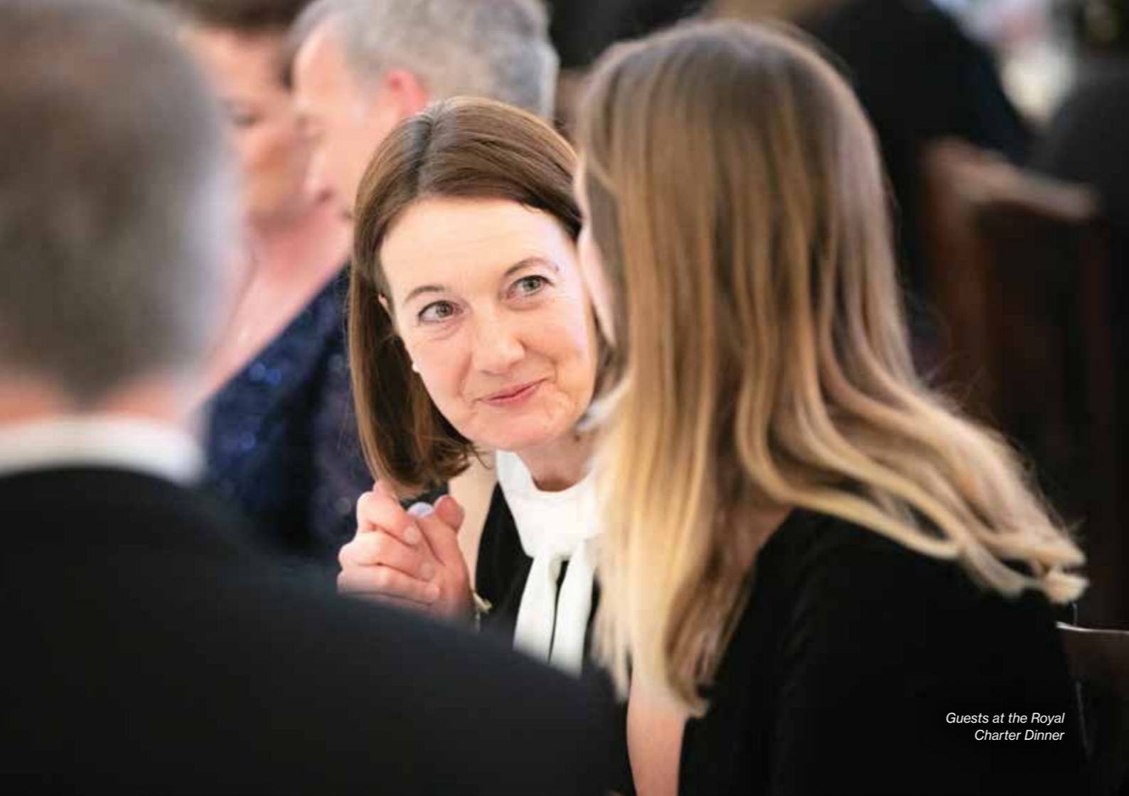
Guests at the Royal Charter Dinner