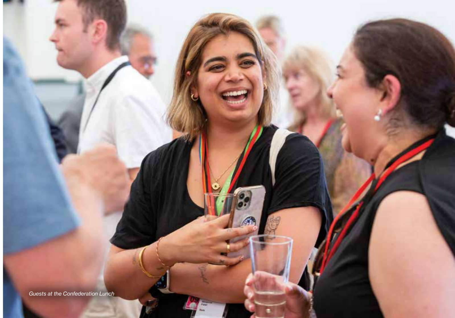
Guests at the Confederation Lunch

What our members tend to have in common is a passion for the furnishing industry, a philanthropic desire to 'give back' and a wish to meet and converse with like-minded individuals.