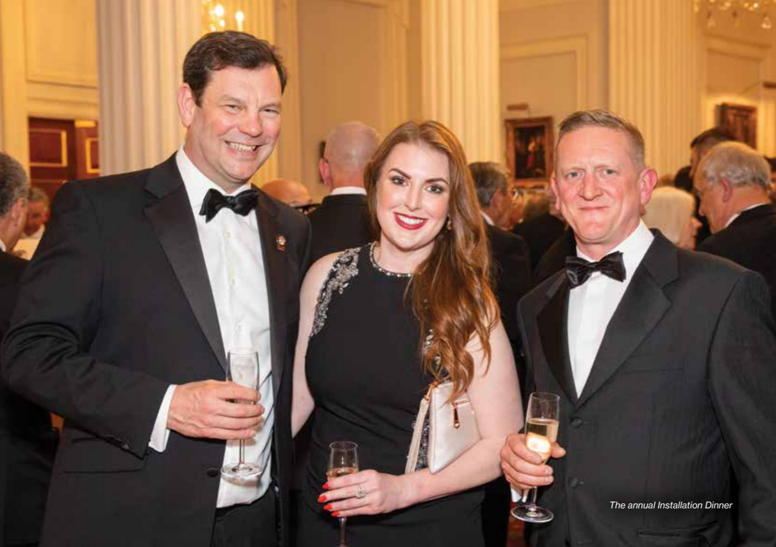
The annual Installation Dinner