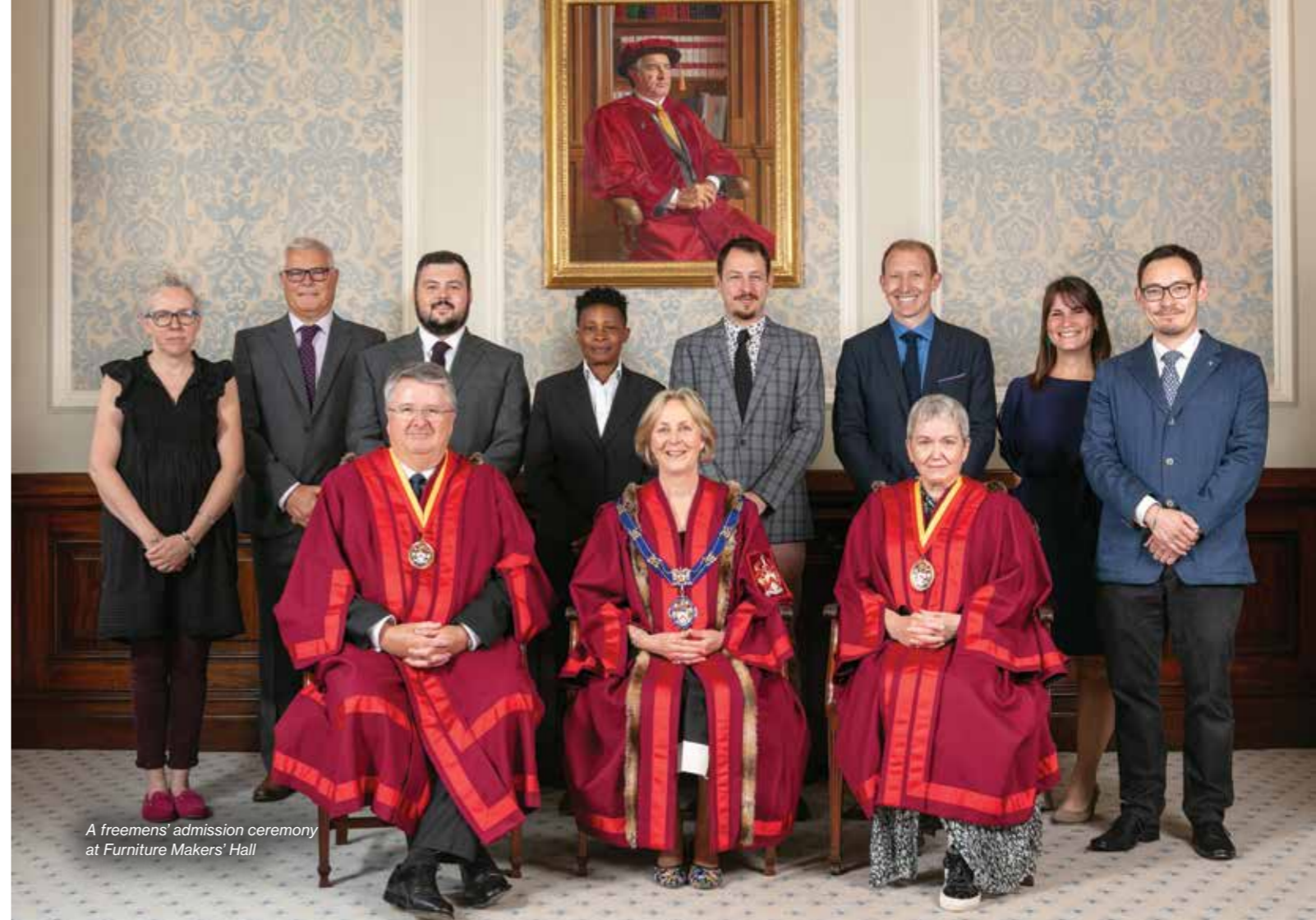
A freemens' admission ceremony at Furniture Makers' Hall

If all goes well, we will then arrange for you to attend a formal admission ceremony at Furniture Makers' Hall with other new freemen, during which you will sign the declaration and be personally welcomed into the Company by the Master and wardens.