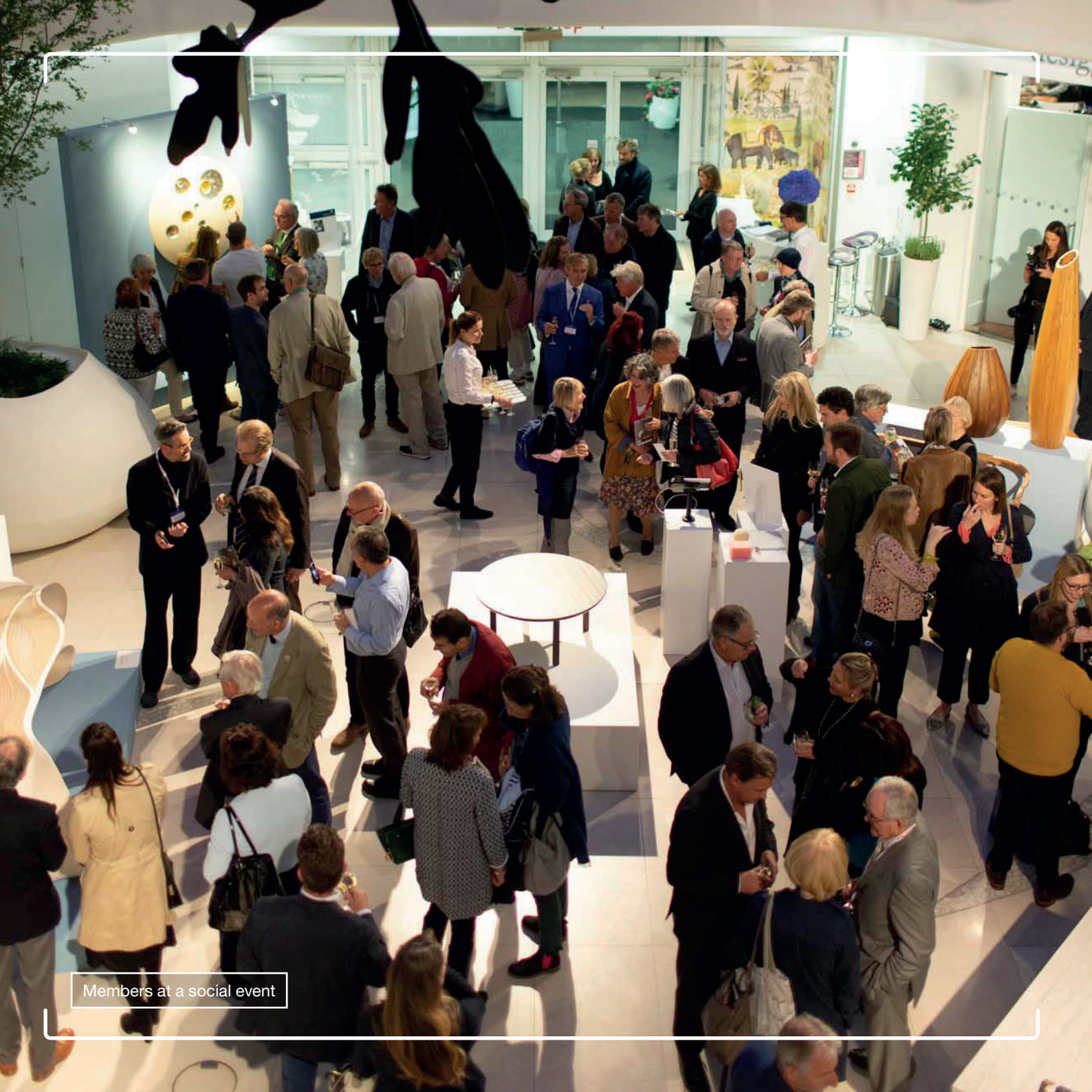
Members at a social event